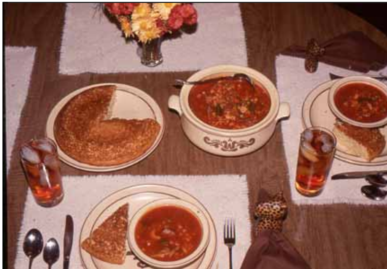
Soup and a pone of cornbread makes a hearty February meal.

Serve over rice or pasta or with a pone of cornbread.