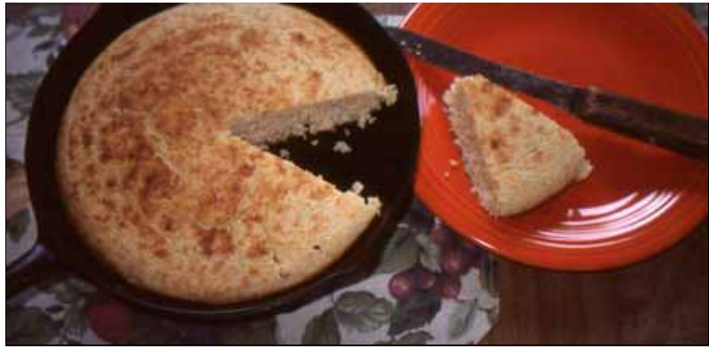
A pone of cornbread.

bacon, and (3) Use stone-ground cornmeal. Most store-bought cornmeal has been ground at too high a temperature and this does something to the flavor. Also, stone-ground cornmeal, even if it is sifted, has more body or "crunch" to it.