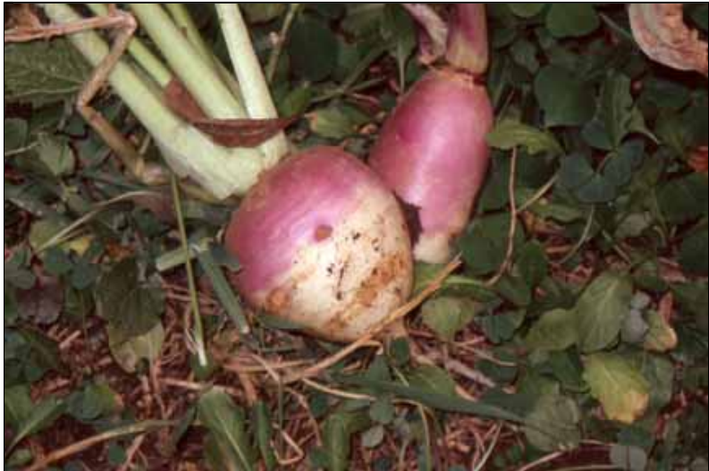
Turnips can form the basis of pot likker as a substitute for cabbage, and they make a mighty fine dish.

When cooked you can pour off the pot likker and serve it separately or, as Grandma Minnie always did, leave the cabbage, meat, and juice together. When served with a pone of cornbread or maybe hoe cakes, along with a bowl of stewed apples, this makes a hearty and exceptionally satisfying meal.