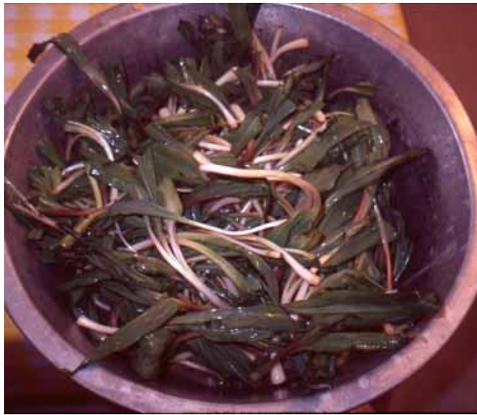
Bowl of Ramps

While I can't avail myself of ramps in nearby woods, there is poke sallet aplenty along ditch banks, in old clearings, on rural roadsides, and the like. Finding poke is no problem, but it's morels which captivate me. They are elusive, pop out suddenly during warm spells (often after rain), and can be quite difficult to find. Yet the 100 or so acres I own produces a good crop of them year after year, and rest assured as I hunt turkeys there my eyes are also constantly searching for morels. Once located, they are of sufficient meaning to make me forget all about turkeys for a time. Indeed, I know of at least two occasions where my obsession with morels has cost me turkeys. But turkeys can be hunted for a month; morels are only around for 10 days to two weeks.