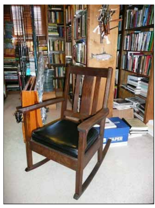
Grandpa's rocking chair, where he held court on cold winter days. It now rests in my study with row upon row of books comfortingly close by.

In truth I didn't need any encouragement when it came to getting outdoors. Whether hunting small game, simply wandering in the winter woods, looking for likely fishing holes come spring, swing on wild grape vines, shinnying up limber pine saplings and "riding" them to the ground, building forts against a perceived Indian