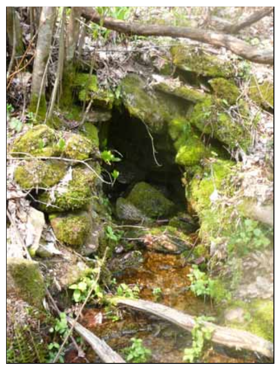
This is the rocked in spring where Grandpa and Grandma raised their brood in what is now the Great Smoky Mountains National Park.

I'm afraid today's youngsters don't pursue enough of these kinds of simple activities, but many of them are readily available. All they take is what Grandpa would have called "a ration of gumption." That being said, I'll close with two thoughts. First, encourage kids to get outdoors, because there's plenty for "a body to do." Second, never mind that I'm now pretty much of the age Grandpa was when he was opining, it looks like a fine day to go bushytail hunting, and it's been too long since I enjoyed a mess of squirrel and sweet taters.